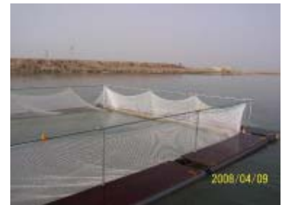
Finished net pen awaiting fingerlings, Photo by Ibrahem M. Abd

Aquaculture is an important income-generating activity in Iraq but is not always conducting in an efficient or environmental friendly manner. Most of these activities in Iraq have consisted of establishing fish ponds fed from the closest available water resource, which drained to the same source.