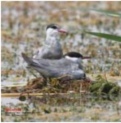
Whiskered Tern in Southern Marshes, Photo by O Fadhel.