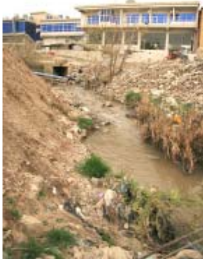
Sewage Outfall in Sarchinar, Sulaimani

The Tanjero is a small river that has its source in the foothills and mountains around Sulaimani. As it travels down to become one of the main sources of water to Darbendikhan Lake and eventually the Diyala River, it faces many problems and impacts. The water is heavily utilized for agriculture in the area and thus contains the runoff of agricultural pesticides and fertilizers. It is also, for much of its course affected by gravel mining operations that operate heavy machinery in and along the gravel beds of the river, causing many adverse physical affects to the stream's biota and riparian zone. But one of the largest impacts on the river is that it carries almost the entire sewage load of the city of Sulaimani, a town of over one and one-half million people. This sewage is not treated in any way before entering the river and by the time the river leaves the city it is essentially an open sewer.