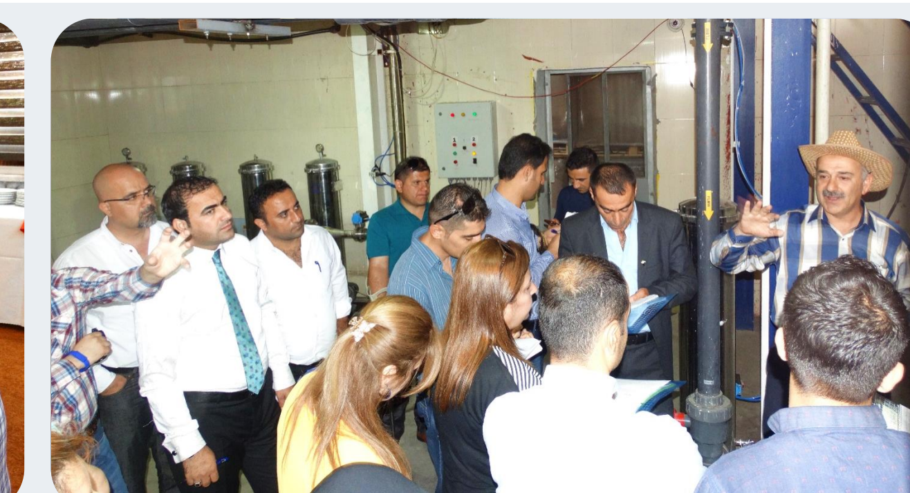
Site visit to Ala Company