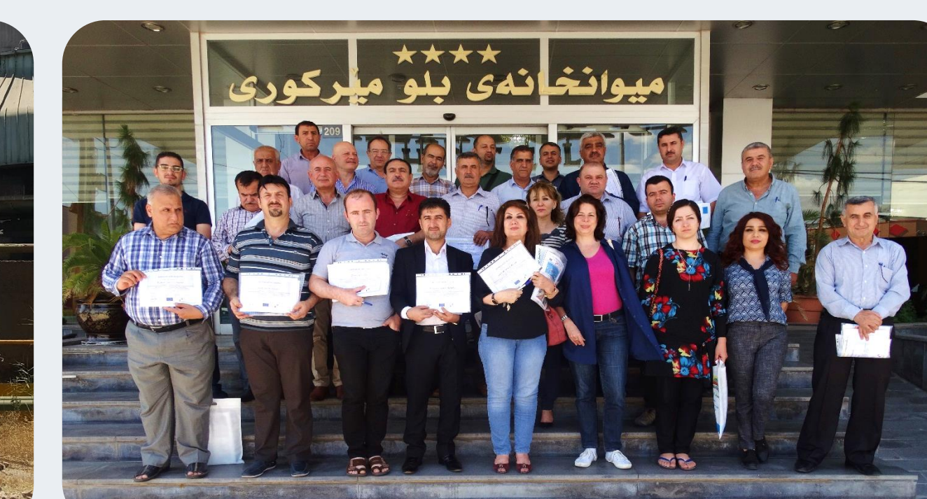
Certification to the attendance