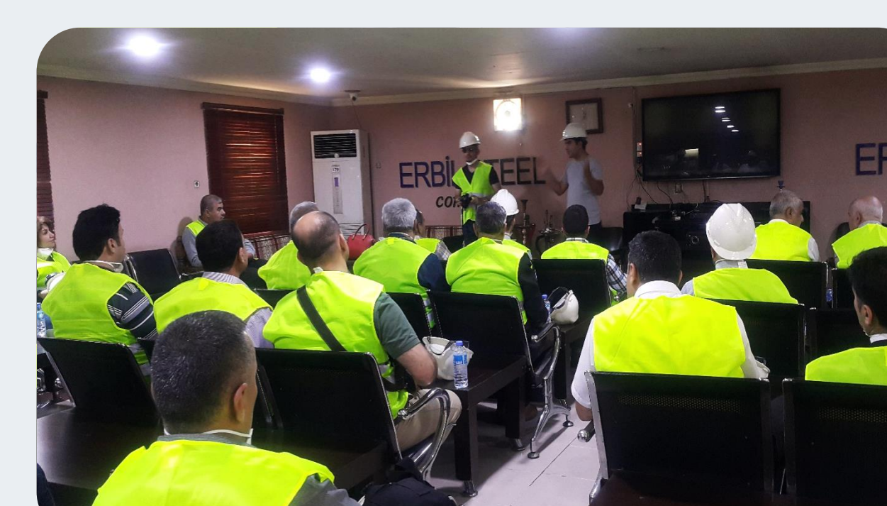
Site visit to Erbil Steel Company