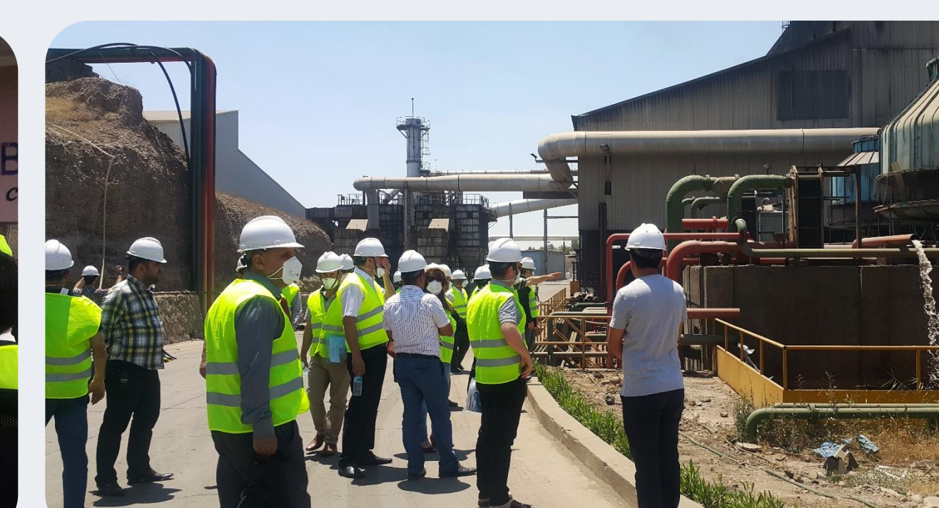
Site visit to Erbil Steel Company