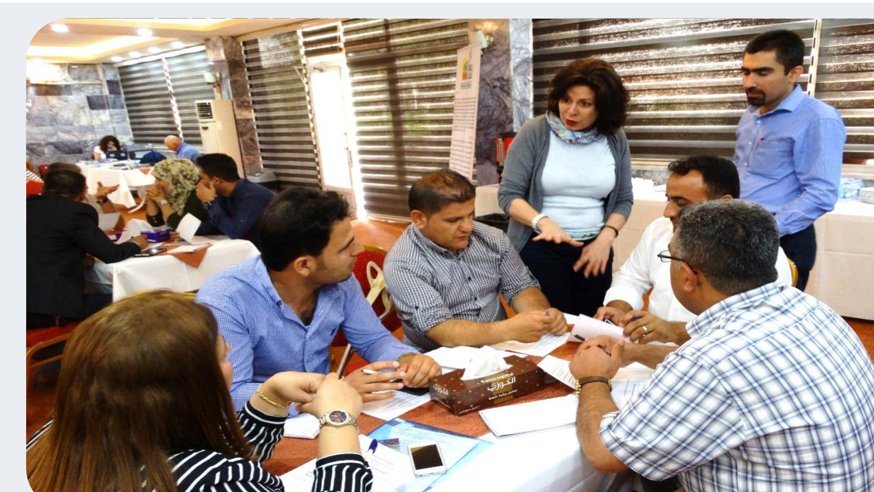
Team work / Group work

Environmental Inspectors perform routine investigations of certain job sites and other areas to assure that all projects are compliant with essential environmental regulation. As a result, they are an essential component for protecting the health of both the land and the general public. This job involves a familiarity with environmental regulations, as well as an ability to accurately record the compliance level of a particular site. Environmental Compliance Inspectors work both in the office and out in the field, striking a spectacular balance between the varied and the routine.