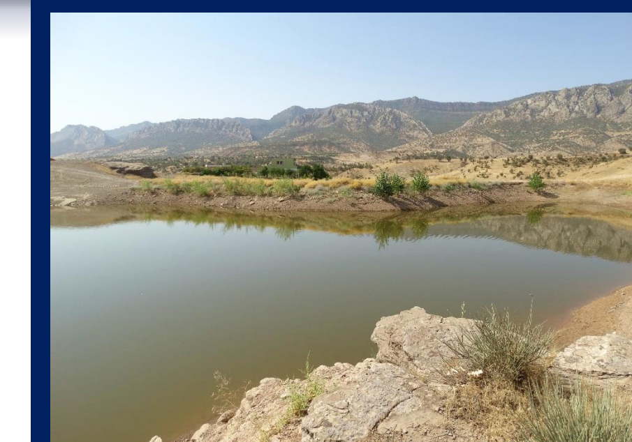
Field visit on 11-9-2017 To water resources in KRI

tourists in order to keep clean and protect environment of those areas, and also to distribute special posters at checkpoints with instruction to protect environment, to give each family at least one poster so that the beautiful environment of Kurdistan is protected from pollution.