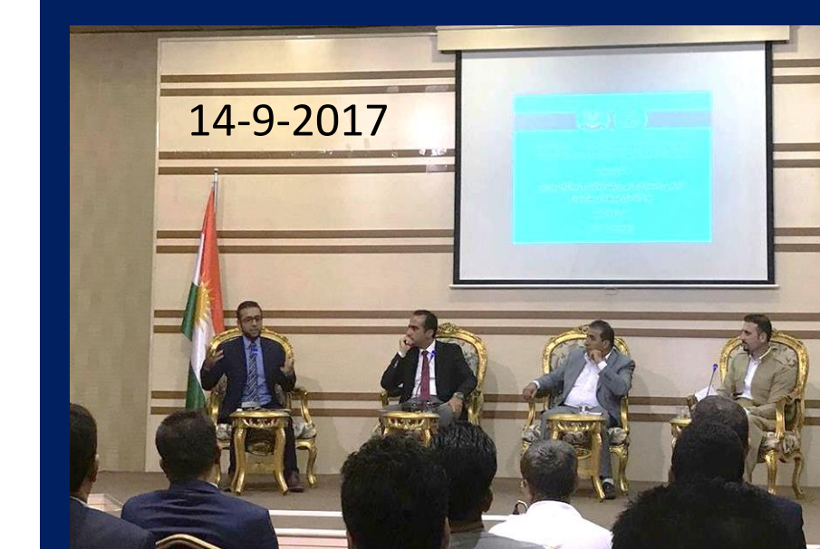
14-9-2017 role of civil society organizations in the Referendum process in KRI

For more information about the Project, visit: www.natureiraq.org > Projects > WaterKeeper Law and Advocacy Program