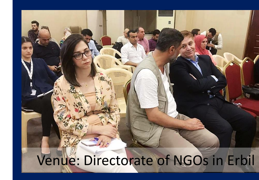
Venue: Directorate of NGOs in Erbil