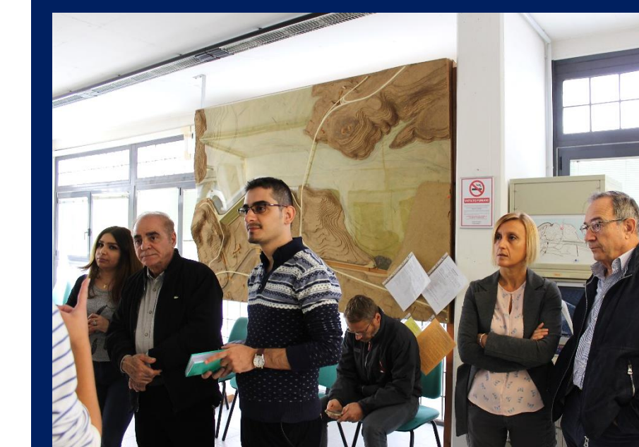
Field visit to Bilancino dam in Florence, Italy on 10-10-2017