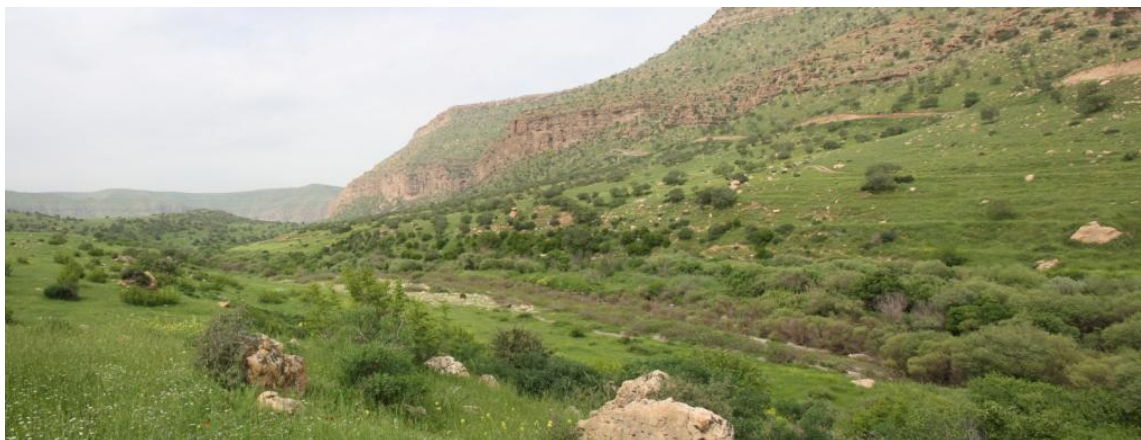
Chami Razan Area looking west